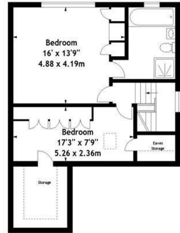
Second Floor 585 sqft

Measured in accordance with RICS guidelines. Every attempt is made to ensure accuracy, however all measurements are approximate. This floor plan is for illustrative purposes only and is not to scale. © Datography Ltd 2014 Photographs * Floorplans * Virtual Tours Tel: 0845 643 4401 www.datography.com